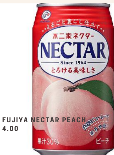
FUJIYA NECTAR PEACH 4.00