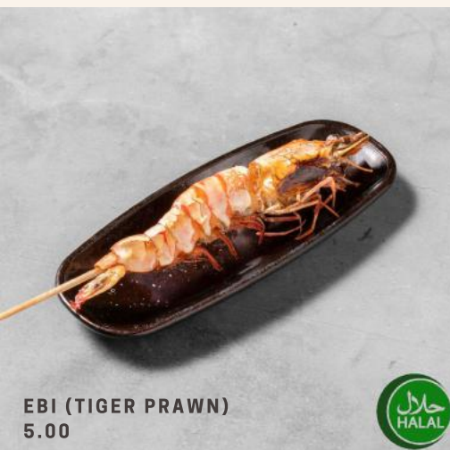
EBI (TIGER PRAWN) 5.00