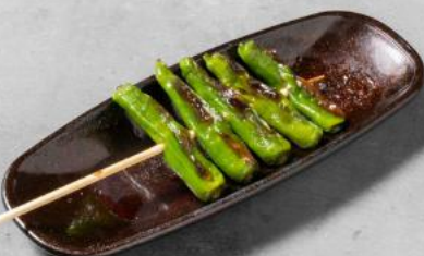
SHISHITO (JAPANESE PEPPER) 4.00