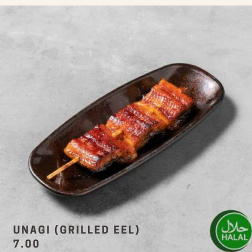
UNAGI (GRILLED EEL) 7.00