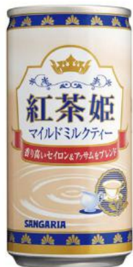
SANGARIA KOCHAIME MILD MILK TEA 4.00