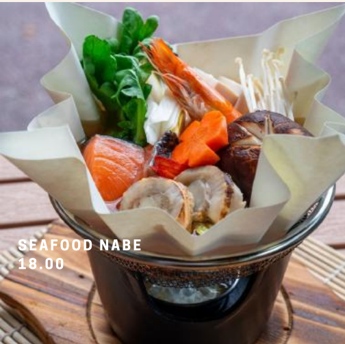
SEAFOOD NABE 18.00