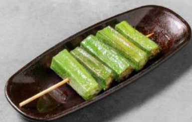
OKRA (LADY FINGER) 2.00