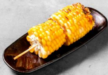
YAKI TOMOROKUSHI (GRILLED SWEET CORN) 3.50