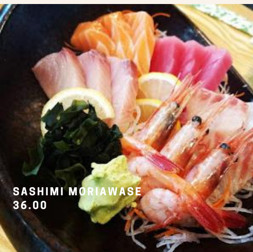
SASHIMI MORIAWASE 36.00