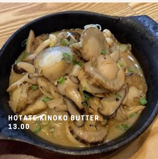
HOTATE KINOKO BUTTER 13.00