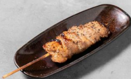
KAMO (MARINATED DUCK MEAT) 4.00